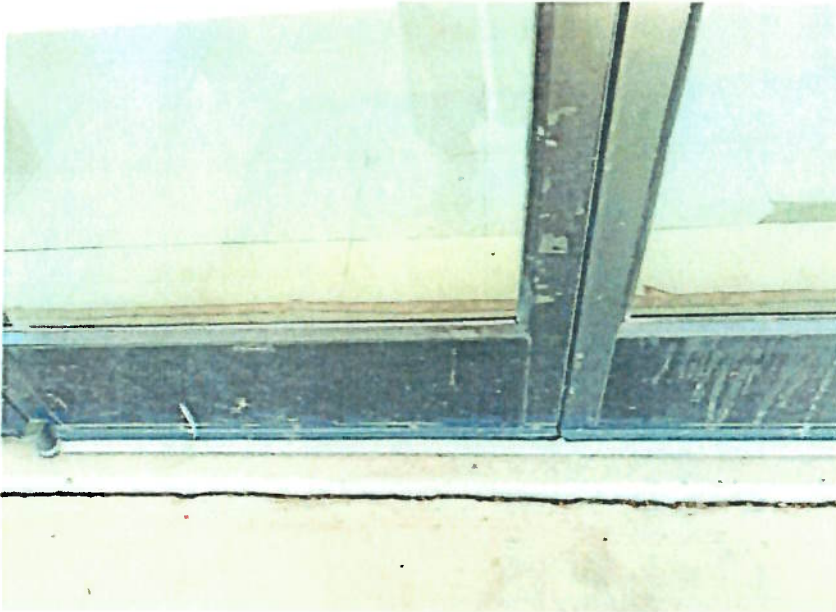
Photo 6: Excessively large change in level right in front of main entrance