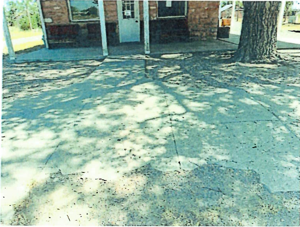
Photo 5: Crumbling of the curb ramp immediately in front of the community center (not connected to any parking)